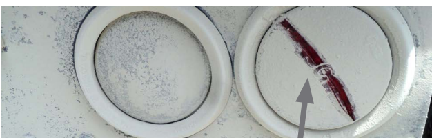
Spot wiped clean

While you may not always have time to wash your vehicle, especially during poor weather conditions or busy times, make sure lights, reflectors and conspicuity tape are wiped clean during inspection as they will increase your safety margin. See the difference in the photo below.